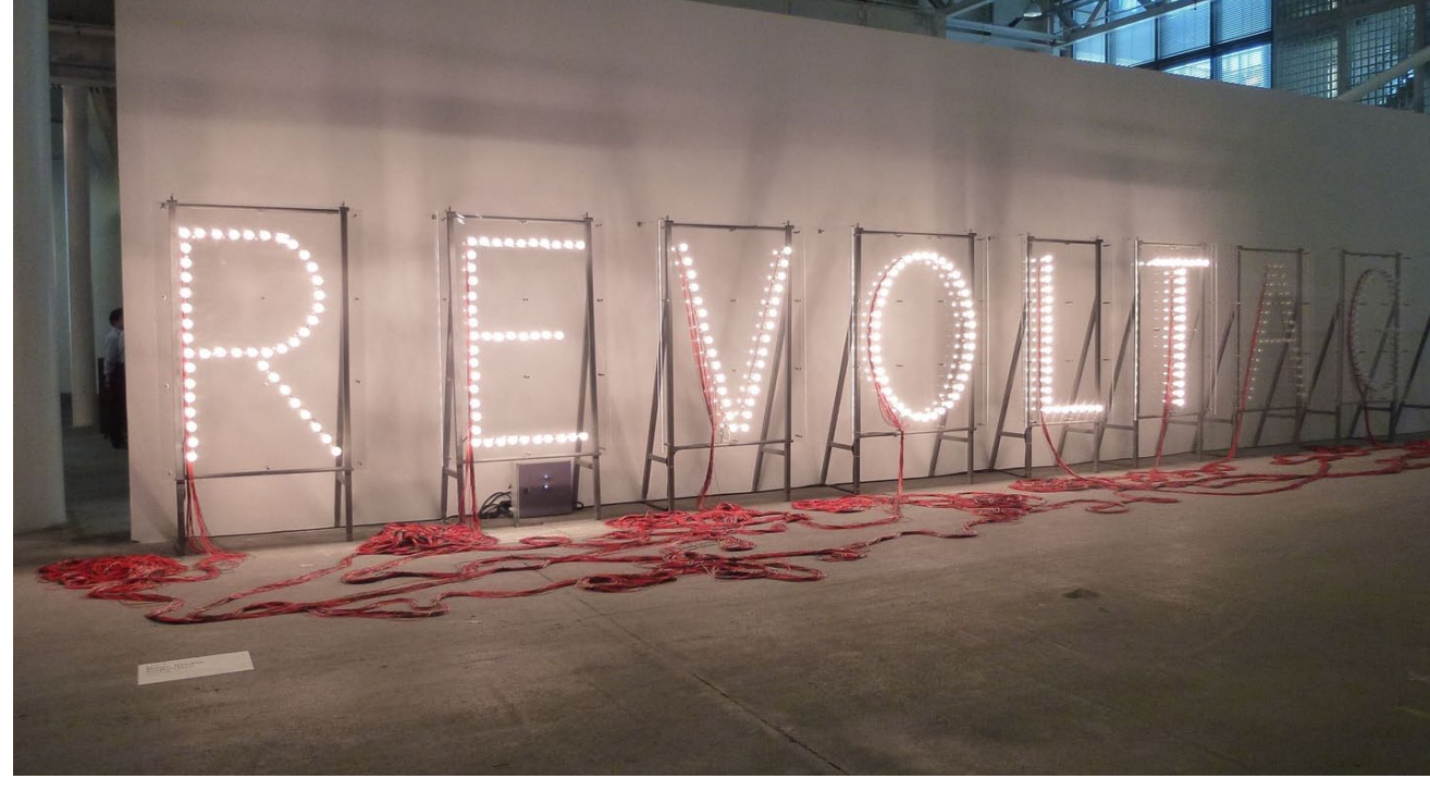
RAQS Media Collective, Revoltage, 2011. Frith Street Gallery (London).

as elitists in the intellectual sense. Can we continue to assume that we can still be egalitarian in other ways while maintaining such hierarchies?