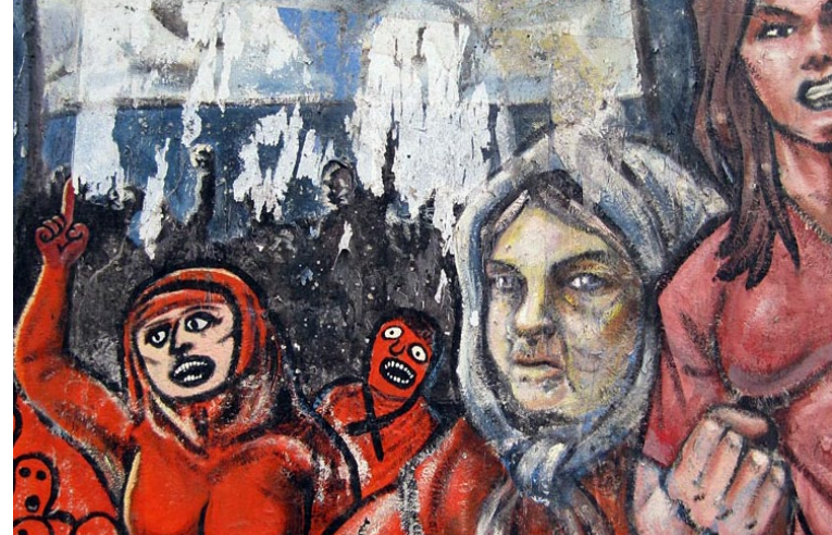
Protest graffiti in Argentina depicting Mothers of the Plaza de Mayo.