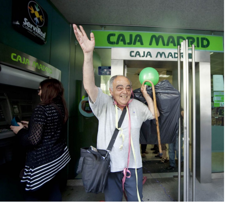
Celebrating the closing of a Bankia account in Barcelona.

be throwing a party (as you can see, we just love to throw parties).