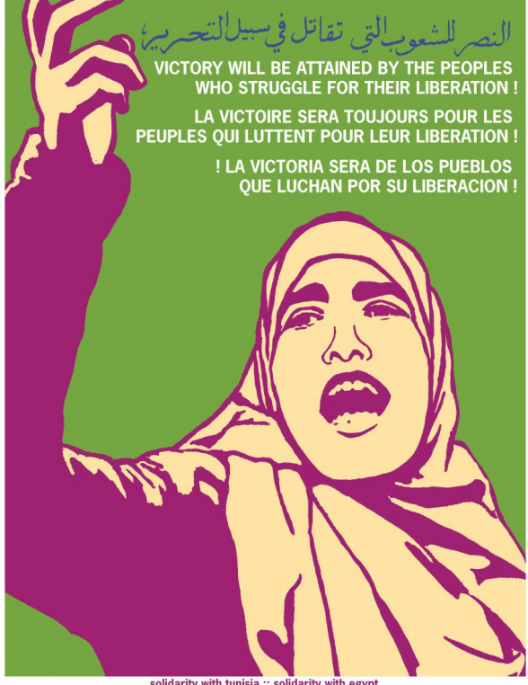
solidarity with tunisia :: solidarity with egy www.DignidadRebelde.com

Let me be clear: I want to complicate everything.